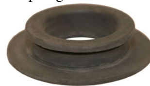
CDHF – Flange