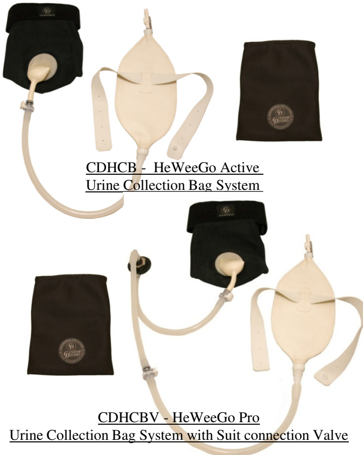
CDHCB - HeWeeGo Active Urine Collection Bag System