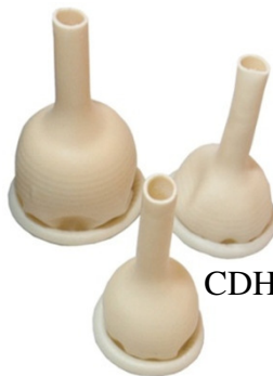
CDHSO – Sheaths