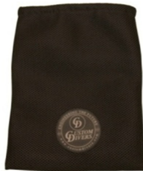
CDHDH – Drawstring Holdall