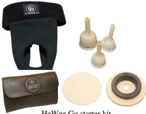
HeWee Go starter kit

Your HeWee Go starter kit comprises of an adjustable support belt which is suitable for waist line up to 40" (a 10" extension strap is available as an accessory), three different size sheaths 30, 35 and 40mm, two sizes of diaphragm (small or large) and one flange.