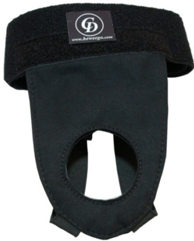
CDHSB – Support Belt