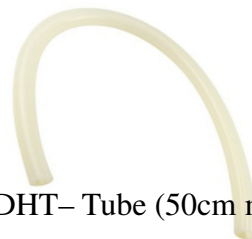
CDHT – Tube (50cm mtr)