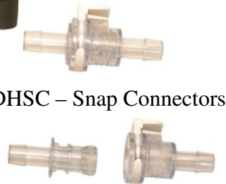
CDHSC – Snap Connectors