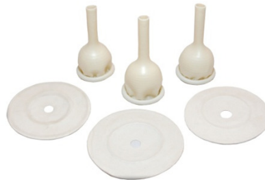
Replacement Sheaths and Diaphragm Kits.

Fitting these parts together is simple. A suit P-valve will need to be fitted to your dry suit, instructions on how to do this will be supplied with the valve or alternatively your local dive suit manufacturer would be happy to install one for you.