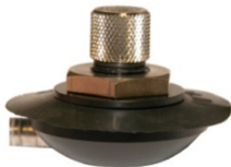
CDHPV – Non - balanced suit valve.