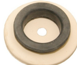
CDHDO – Diaphragms