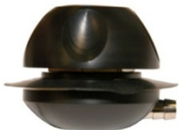
CDHPVB - Balanced suit valve.