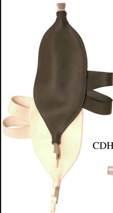
CDHUCB – Urine Collection Bag (black or white)