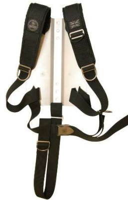
S40 WING SYSTEM WITH ONE PIECE HARNESS

The S40 wing system has been designed to give total flexibility to divers wishing to adapt their kit configuration for different diving set ups.