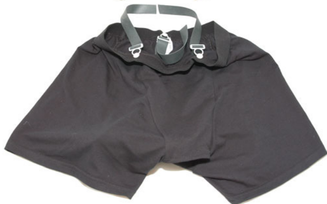
Diagram shows internal straps