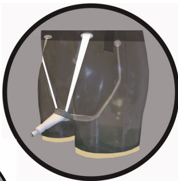
P-valve shown is for illustration purposes and not included with the Shewee Go kit.